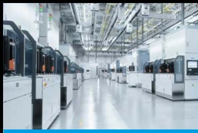
Semiconductor & photovoltaic