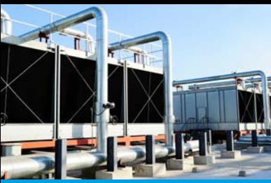
Refrigeration & air conditioning