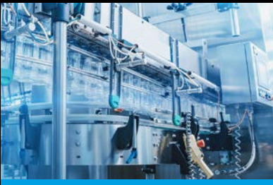
Food & beverage industry