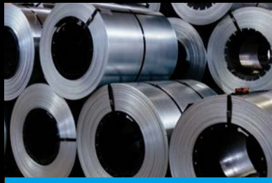
Steel & iron