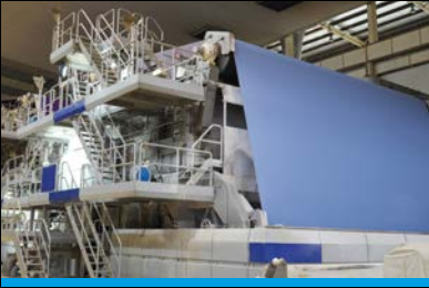
Pulp & paper